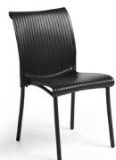
ANTRACITE vern. antracite

PT Cadeira sem braços. Material: polipropileno fiberglass com tratamento anti-UV colorido na totalidade. Pernas em alumínio pintado. Acabamento fosco. Com pés antiderrapantes. Resina reciclável.