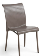
TORTORA vern. tortora