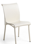
BURRO vern. burro